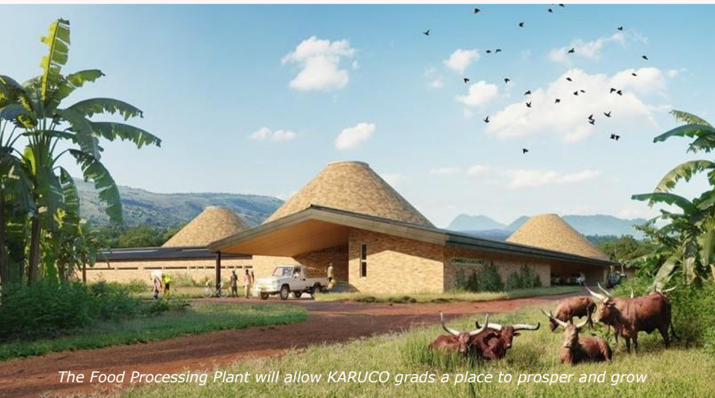
The Food Processing Plant will allow KARUCO grads a place to prosper and grow